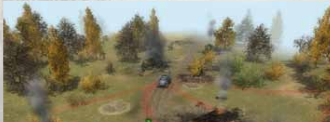
In-game screenshots of each mission.

Zones. The main idea behind this is to avoid overwhelming the player in large maps.